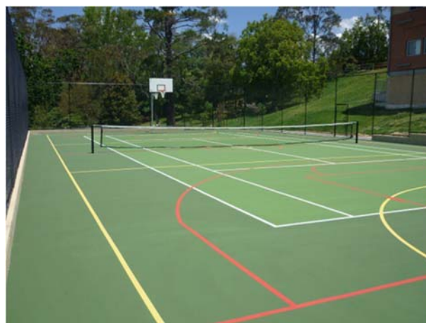
Cootamundra High School P & C Association

The P & C is also working towards a large project of replacing the current basketball courts with covered multi-purpose courts which will be similar to the picture below however covered for weather protection.