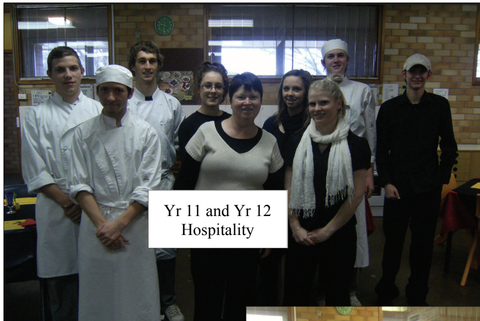
Yr 11 and Yr 12 Hospitality

We were delighted to have as our customers: