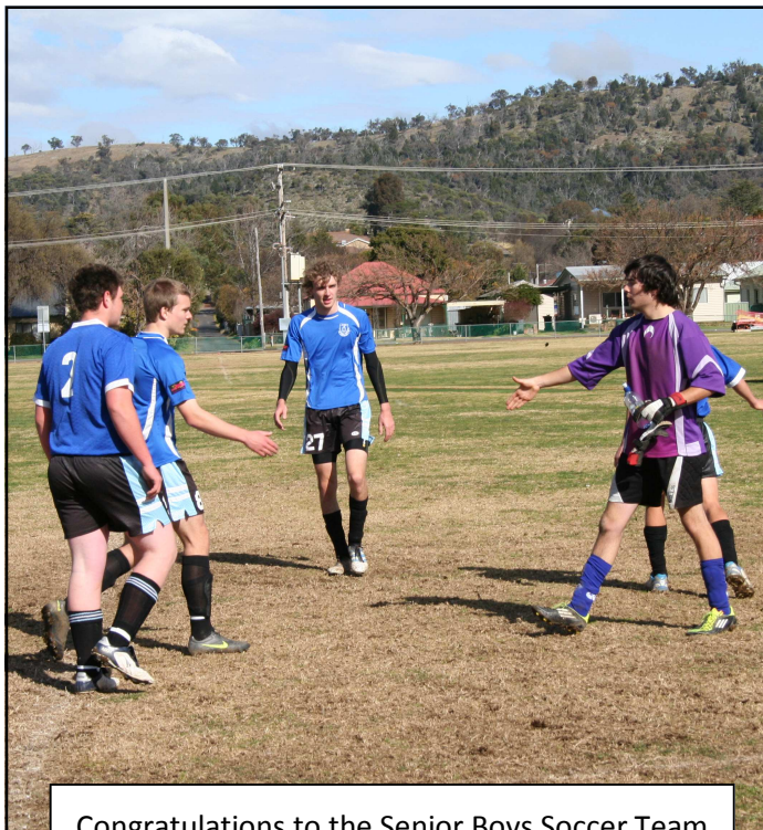
Congratulations to the Senior Boys Soccer Team