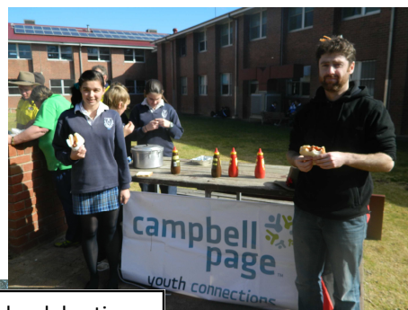
NAIDOC week celebrations