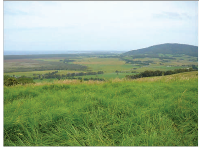
In the distance a view of 7 Mile beach.