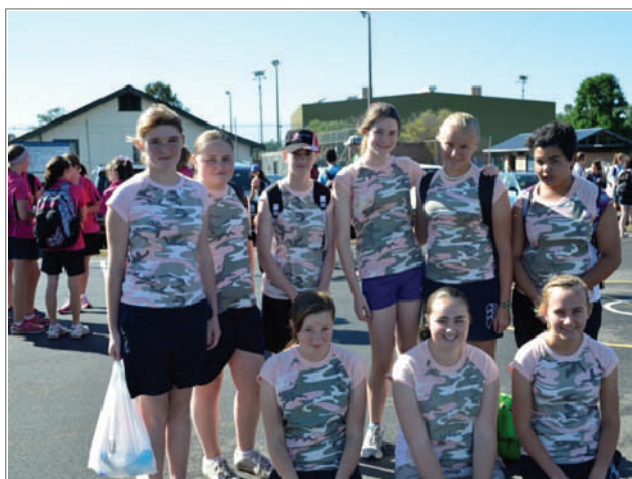
‘DON’T TOUCH THIS’