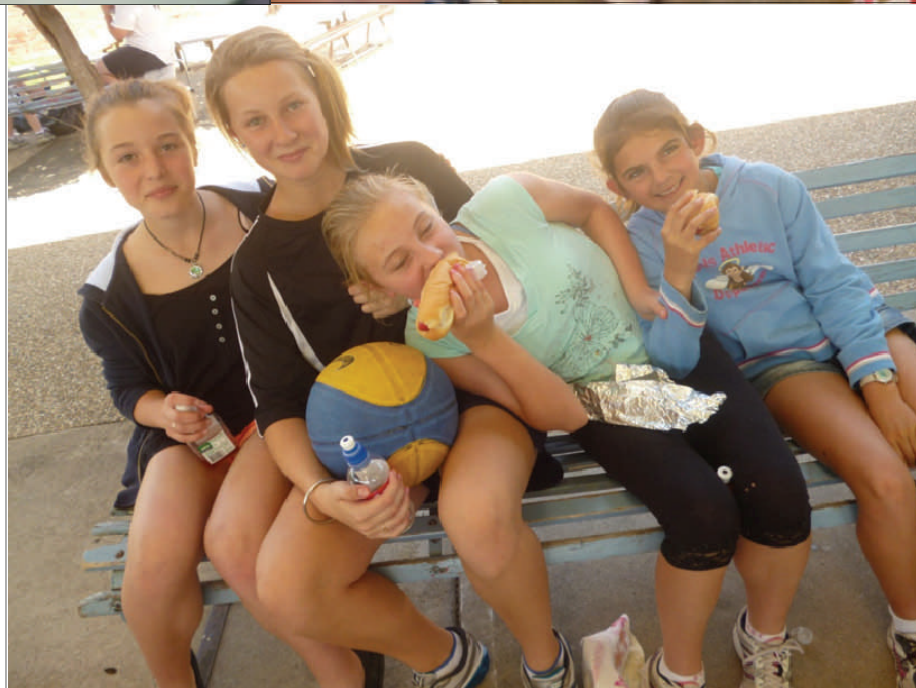
Photographs above - Year 6 students