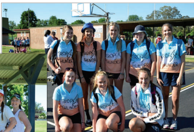
Above: ‘TROPIC THUNDER’