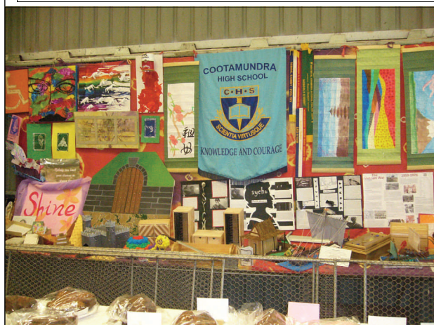
Left: Show Display for Cootamundra High School